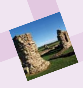
Opening Times: Any reasonable time