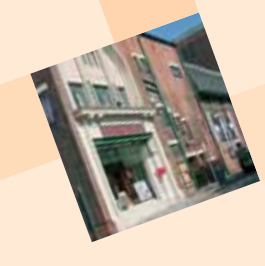
Box Office Open: Mon - Sat 10:00 - 14:00

There are a variety of exhibitions throughout the year, visit the website for latest news.