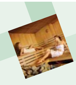
Opening Times: Visit the website for details of opening times and admission prices

A total of 6 lakes and a small stretch of the River Idle that can accommodate up to 400 anglers. Camping Pitches & Touring Facilities, Cafeteria with licensed bar, serving breakfasts, snacks and after match food. Shower block and on-site well stocked Tackle shop. Has disabled toilets.