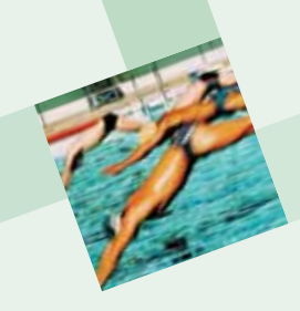
Opening Times: Visit the website for details of opening times and admission prices