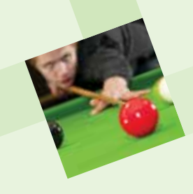
Opening Times: Mon - Fri 09:00 - 23:00 Sat - Sun 10:00 - 17:00

Bircotes Leisure Centre hosts a variety of facilities providing the perfect mix of sporting and leisure activities. The swimming pool caters for all manner of sessions, including early morning swims, family swimming, adult relaxation and fun swims. The fitness classes range from Yoga to Aqua Aerobics and there is a wealth of sports based activities for children, including swimming, gymnastics, trampoline classes, gym tots, dance, junior souash and badminton.