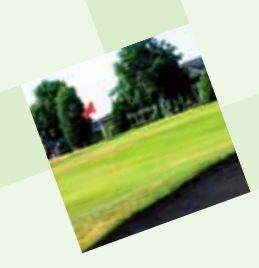
Opening Times: Open all year round